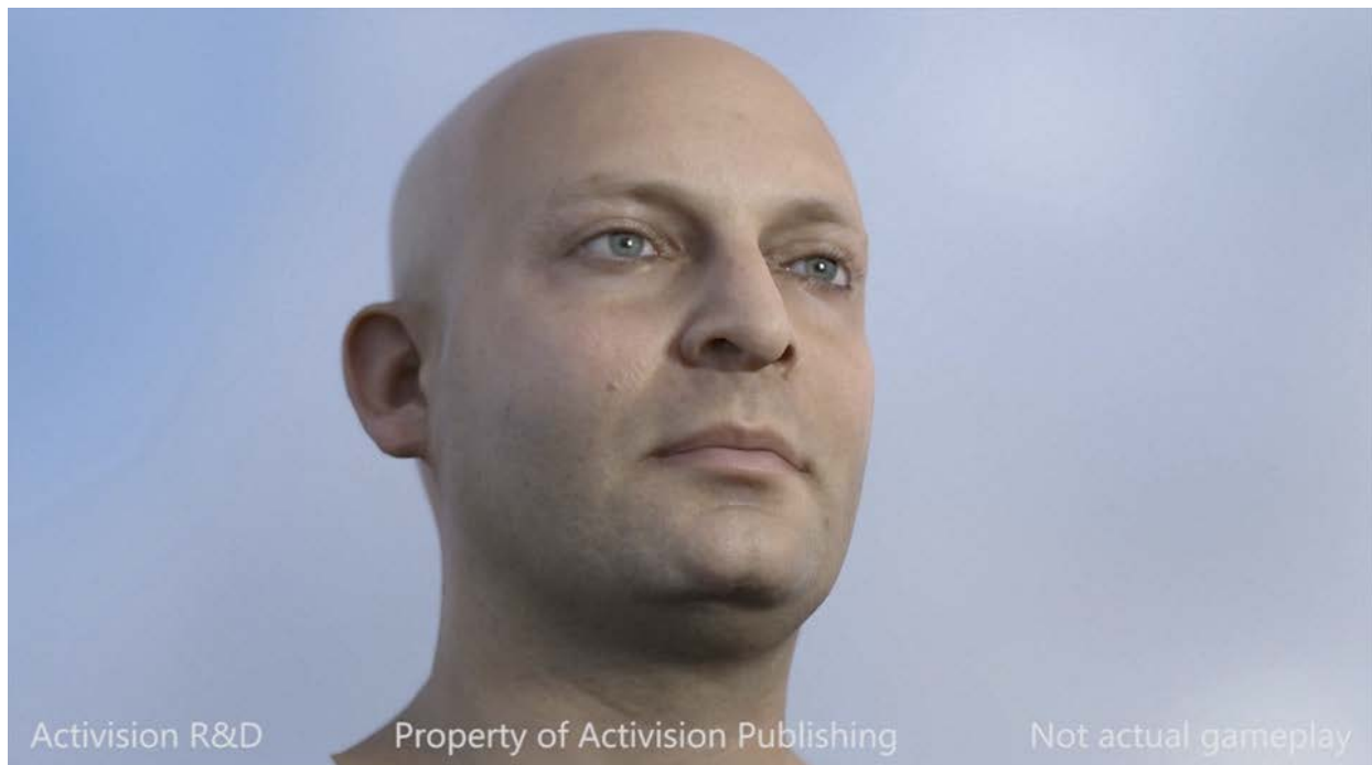
Figure 2. Digital Ira represents the state of the art for extremely high quality digital human representation. For more information see http://ict.usc.edu/prototypes/digital-ira/ .

Challenges remain in translating these DH prototypes into a digital transportation platform. Capture methods sometimes require cumbersome sensor configurations or markers, digitization is sometimes done ex situ from the performance capture data, hair is often omitted, only select parts of the body are captured in high fidelity, precise mouth movements are lacking, and details around the eyes and mouth during expressions leaves something to be desired. Advances in all of these areas are required to achieve a DH-based digital transportation technology.