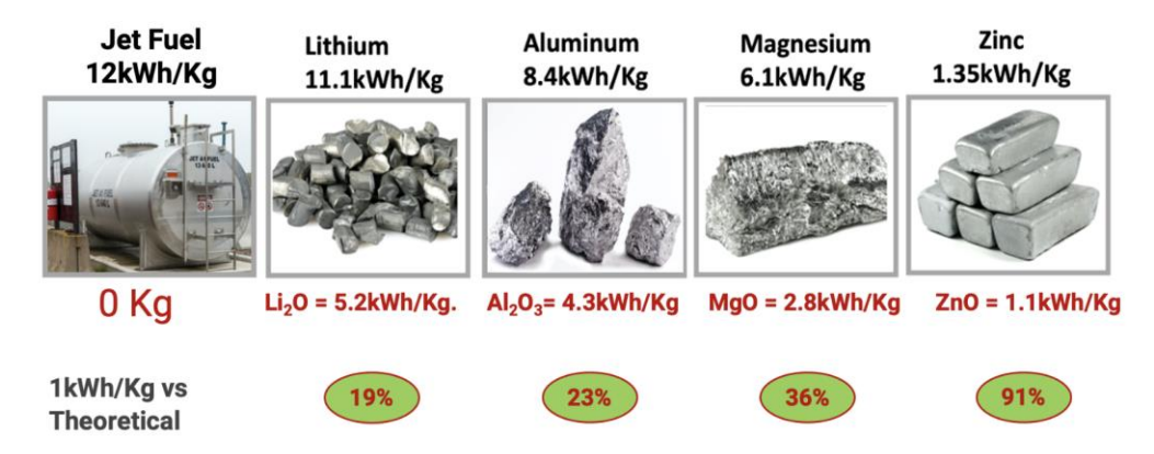
Figure 2: Theoretical energy densities of metals as fuels presented together with their corresponding oxides. Note: sodium, calcium and potassium may also have merit.

Note: Further details can be found in the recording of the ARPA-E Summit. <u>https://www.youtube.com/watch?v=IZ6iQHolab0</u> Values in red represent the energy density based on the oxidized form that would be retained on board the vehicle. Jet Fuel = 0 because it is expelled by the jet engine during combustion;1kWh/Kg vs theoretical is 1/metal oxide weight expressed as a percentage (%).